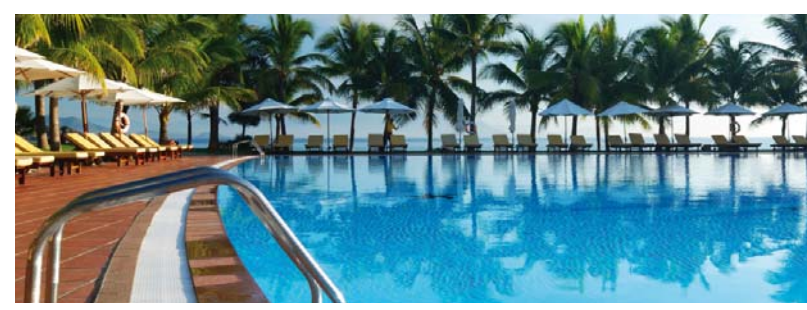
Determination in recreational or touristic environments.