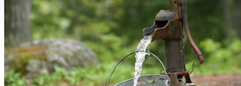
Decontamination of ground water